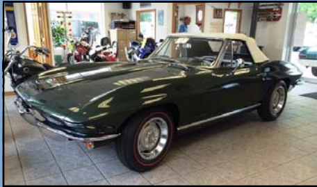
1967 Chevrolet Corvette Convertible

In white with grey leather interior with Ostrich accents. The engine is the 350hp Mercedes Benz Diesel with an Allison automatic transmission. Full Air Ride cab and front seats are as well. Rear seat folds down into a bed. Has dual fuel tanks. It's has a Dodge Dually factory bed on the back. Full carpeted bed. Freightliner dual Air Horns. Over $150,000 when new. Only 37,000 miles. It had a full service just about a month ago so it's ready to hit the road!