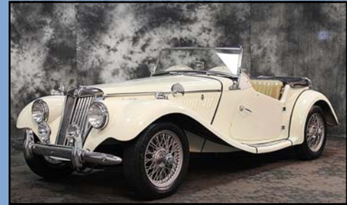
1955 MG TF 1500

A very nice frame off restoration of a California car. Featuring a Midnight Blue body with a matching Hartz cloth top and gray leather. The chrome is excellent and the engine is highly detailed. Has an Inline 8 282ci 120hp engine with a 3-speed with overdrive. Equipped with a radio, heater, power top, wide whitewall tires, spot light and fog lights. This is a show quality car that is a pleasure to drive.