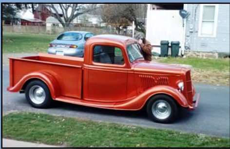
1935 Ford Streetrod Pickup

This Spirit of America edition has just 13,000 original miles. It comes with its original build sheet.