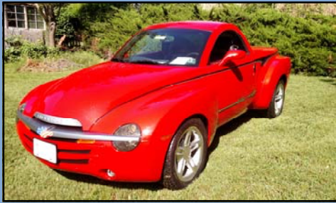
2004 Chevrolet SSR

This MG is a true, numbers matching TF 1500. This original roadster is one of the 3,400 produced with the 1466 cc engine rather than the smaller 1250 cc engine in its last year of production. This TF 1500 is truly resplendent in its Primrose Yellow exterior finish, complemented by Butterscotch upholstery. The interior is in amazing condition. You'll be very proud to show and own this classic.