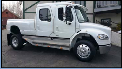
2006 Freightliner M2 Phoenix Conversion

In white with grey leather interior with Ostrich accents. The engine is the 350hp Mercedes Benz Diesel with an Allison automatic transmission. Full Air Ride cab and front seats are as well. Rear seat folds down into a bed. Has dual fuel tanks. It's has a Dodge Dually factory bed on the back. Full carpeted bed. Freightliner dual Air Horns. Over $150,000 when new. Only 37,000 miles. It had a full service just about a month ago so it's ready to hit the road!