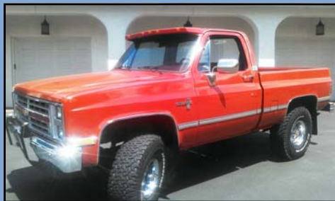
1986 Chevrolet Silverado 1500

This magnificent car was displayed at the 2002 Carlisle All-Fords Event and the AACA "Tail Fins" exhibit in 2008. Has the rebuilt 300hp 368ci V8 with an automatic and 59K original miles. Has power brakes, power steering, power seats, power windows, power antenna, quadra lights, signal seeking radio with foot switch and a mileage meter. In excellent running condition and always garage kept.