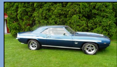
1969 Chevrolet Camaro Yenko Recreation

This is Bricklin Vin #0788, a 1975 Safety White car with just 19,000 original miles. Powered by the Ford engine with an automatic transmission. It has an all acrylic body with automatic pneumatic gullwing doors. This fine example is very clean and is 1 of only 2900 Bricklins produced. A certain future collectable.