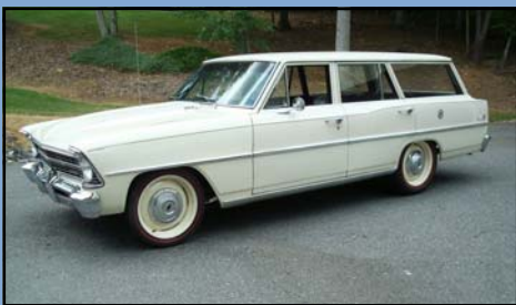
1967 Chevrolet Nova Station Wagon

This custom Plymouth Coupe has an all steel body. The power comes from a Corvette LT1 drivetrain with an automatic transmission. For added comfort, it has air conditioning. Very well executed Plymouth Street Rod.