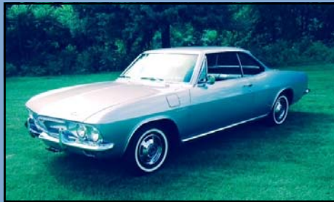
1965 Chevrolet Corvair Corsa Turbo

This SSR has 57,000 original miles. The engine is the 5.3 Liter V8 that produces 300hp with a 4-speed automatic transmission. It has heated leather seats and the optional wood trim in the bed.