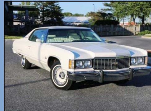
1974 Chevrolet Caprice Spirit of America

This car features the rebuilt, original 389ci V8 with a tri-power carburetor set-up. It comes with its PHS papers. Features include bucket seats, console, automatic transmission, non-working air conditioning and a black vinyl top. A very sharp looking car.