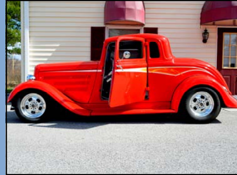
1933 Plymouth Coupe

A very sharp and rare 1957 Bel Air 4-Door Station Wagon with a 327ci 300hp Corvette V8 and a 4-speed manual transmission with power steering. This Wagon has only 600 miles put on it since a complete frame on restoration. This car runs and drives 100% and will not disappoint.