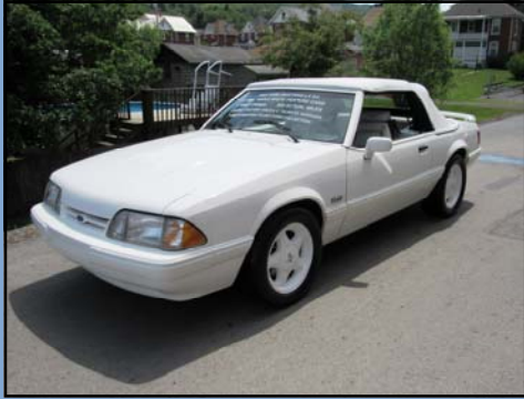
1993 Ford Mustang LX Convertible

One of 1,500 1993 Mustangs produced in triple white with just 34,000 miles. Comes with its window sticker and protect-o-plate. Equipped with air conditioning, electric remote mirrors, power top, glass rear window, electric AM/FM stereo, power door locks, power steering and power windows. It has a 5.0 EFI V8 engine with the 5-speed transmission. Always garaged.