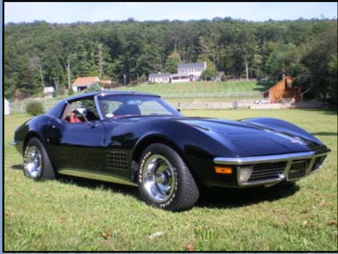
1971 Chevrolet Corvette Coupe

This is a very clean, matching numbers car with full chrome and a 350ci 270hp V8 engine. It has an automatic transmission, factory air conditioning, power steering, T-tops and removable rear window. It is an older restoration with only 24,700 miles. It has nice chrome and new tires making it a good driver and show car. This Corvette has been a part of Jerry's Classic Cars & Collectibles Museum for the past 18 years.