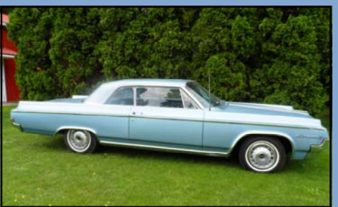
1964 Oldsmobile 88 Coupe

Finished in Grabber Orange over a black leather interior, this 4.6 Liter turbocharged Mustang makes 50hp and 458 ft. lbs. of torque. It has a 5-speed manual transmission, air conditioning, Shaker 500 audio system, 20" Boss wheels and over $15,000 in engine modifications. It has a clean Carfax and has new Pennsylvania safety and emission stickers and lots of documentation. Will easily outperform a 2007 Shelby GT500.