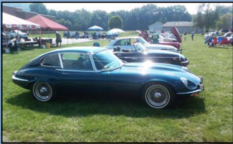
1972 Jaguar XKE Series III 2+2 Coupe

This Coupe has just 30,359 original miles. The engine is the 302ci EFI V8 with an automatic with overdrive. It features tan velour interior, power steering, power brakes, power windows, power door locks, power seat, tilt wheel, cruise control, AM/FM Cassette and air conditioning. It was sold new at Northgate Lincoln in Tampa, FL. This time capsule is like new.