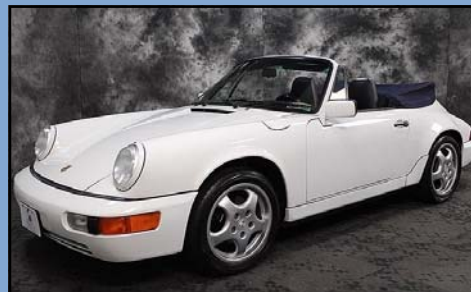
1990 Porsche 911 Carrera 4 Cabriolet

This factory 7 Liter, with an automatic transmission, has the rare factory air conditioning. Also, features power steering and power brakes. A numbers matching drivetrain with only 43,000 miles.