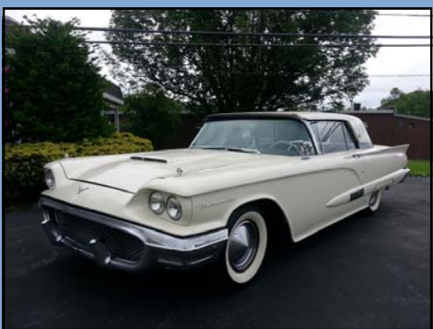
1958 Ford Thunderbird

The final version in the line of Ford Tribute cars", #91 of only 100 produced. Desirable Vista Blue with White accents. Supercharged hand built engine with the engine plaque signed by builder and only 6,300 original miles. Comes with the original window sticker from Roush.