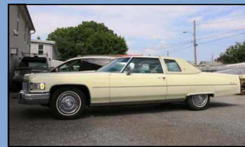
1976 Cadillac Coupe DeVille

One owner, 3ZL package, every option available including two tone seats, full documentation, window sticker etc. Only 3,400 miles original miles. Bought a new one and did not trade this vehicle. Flawless!