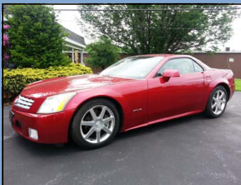
2004 Cadillac XLR

With the XLT Lariat package and a 4 x 4, this 2 owner Georgia truck has been garage kept and is original inside and out. It has 68,000 actual miles and has a V8 with an automatic transmission and air conditioning. A unique find.