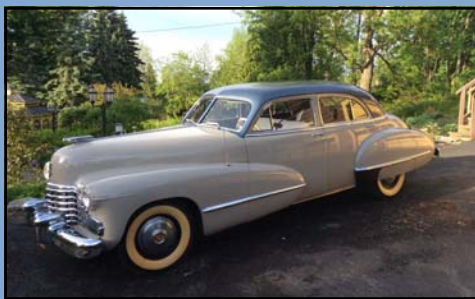
1942 Cadillac Series 62 Sedan

A recipient of a high dollar restoration with a 427ci V8 engine and a 4-speed manual transmission. It features air conditioning and 17" Boyd Coddington wheels. A beautiful build.