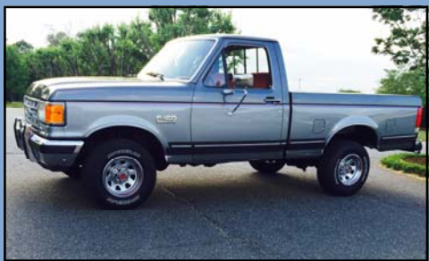
1988 Ford F-150 Pickup

Approximately 47,000 original miles on this desirable body style. Believed to be all original including paint. It has all the available options from 1982 except the CB radio. These Corvettes are gaining in value every day.