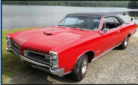
1966 Pontiac GTO

A 4 year complete nut and bolt rotisserie restoration with everything either new or rebuilt with NOS parts. It is a matching numbers car with a 383ci V8 and a 4-speed manual transmission. It has the A57 package and is one of only 378 Cuda's made with a 383 of which only 130 were 4-speeds.