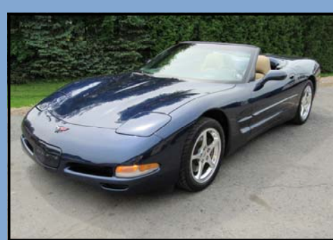
2001 Chevrolet Corvette Convertible

Only 50,500 original miles and originally purchased by Bobby Lee Sottile. It has the 6.75 Liter Rolls Royce engine and history and documentation accompany the purchase.