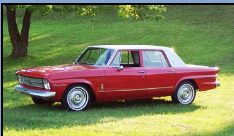
1966 Studebaker Commander Sedan

Powered by a 350ci V8 with a 4-speed manual transmission with a Hurst shifter. It has power steering and power brakes. A great running and driving car.