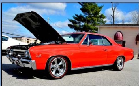
1967 Chevrolet Chevelle SS

This vehicle spent most of its life in California. It is a two owner car with original, unmolested drive train and interior. Some previous paintwork but overall body condition is good. A nice example of the classic BMW 2002 - very restorable and fun to drive.