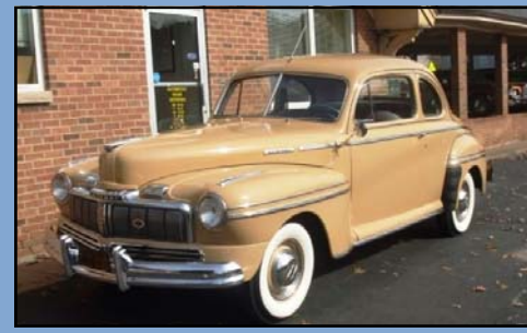
1948 Mercury Eight

Everything is new on this Grand Sport. Powered by the 401ci Nail Head engine with a 4-speed manual transmission. It has just 40,000 original miles and only one repaint. Also, comes with the coveted Protecto Plate.