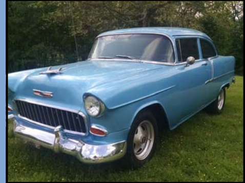
1955 Chevrolet 210 2-Door Sedan

These 1970 Campmobiles are very desirable! The pop-top camper makes these practical as well. This fine one has been garaged the last 24 years and is fresh out. Don't miss this one in its attractive red and white color scheme.