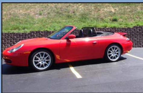
2001 Porsche 911 Carrera Cabriolet

A beautiful Mercury in Taffy Tan with gray cloth interior. A Flathead V8 with a 3-speed manual transmission. Senior National First Prize AACA winner in 1989. These are rarely seen in stock condition.