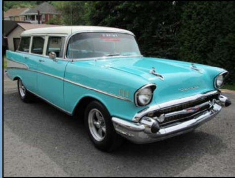
1957 Chevrolet Bel Air Station Wagon

Ford made 700 replicas of the car Halle Berry drove in the James Bond movie "Die Another Day". This is # 527 of 700 produced and it has only 21,400 original miles and was driven only 1,400 miles in the last 9 years. All paperwork from new as delivered and all service records. This Texas car has never had rust and is blemish free. Very collectable Thunderbird.