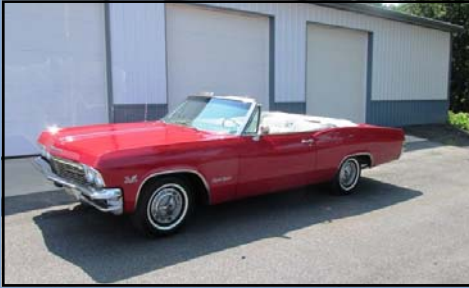
1965 Chevrolet Impala SS Convertible

A highly modified Corvette with a custom Greenwood Can-Am style wide body. Over $10,000 invested in the built 427ci V8 alone, with unlimited power. This machine is ready for the track or can be made into a street car. Not for the faint of heart.