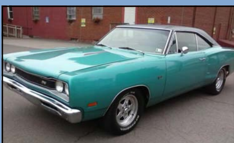
1969 Dodge Superbee

Beautiful white on white with a tan cloth interior. Has the 3.0 Liter V6 with an automatic transmission. Features a power folding top with boot, cold air conditioning, cruise control, power windows and power door locks. With just 30,066 original miles, this LeBaron is ready for many more miles of driving enjoyment.