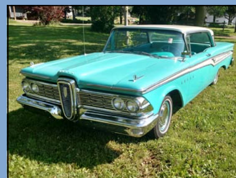
1959 Edsel Corsair Hardtop

Finished in Wimbledon White with gray fenders and a gray interior. It has the original 216ci straight 6 with a 4-speed manual transmission. The electrical system is a 6-volt. This marvelous truck was frame off restored about 2 years ago by the previous owner.