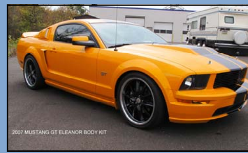
2007 Ford Mustang GT Coupe

This Series 62 is in excellent condition and is finished in a handsome two-tone color scheme complemented with chrome trim, classically enlarged fenders and wide whitewall tires. It features the 346ci V8 engine which produced 150hp. The transmission is a 3-speed manual. A total frame off restoration was completed in 2000. This luxury vehicle is an excellent, comfortable way to drive in style.