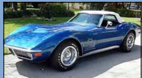
1971 Chevrolet Corvette Roadster

A nice example with a 327ci 350hp V8 with a 4-speed manual transmission. It is painted in Goodwood Green with a white convertible top and white interior. The last year for this Stingray body style and it looks terrific. A very collectable Corvette that you will enjoy owning.