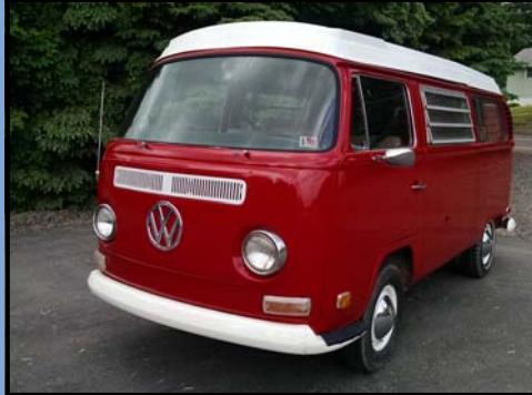
1970 Volkswagen Campmobile

Model T Fords of the “brass era” are probably the most desirable types to the average enthusiast. Certainly they are the most ornate and spectacular in appearance. This Model T Touring has a belt drive transmission with a 4-cylinder motor. A nice driving example.