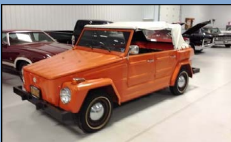
1974 Volkswagen Thing

This highly desirable and collectable 1999 BMW M Coupe is one of the few remaining examples still in its original and in mint condition. Achieving an almost cult status over the years by people in the know, they are highly sought after. We bring you this Arctic Silver over Black Leather M Coupe fully documented with only 99,968 Carfax certified miles.