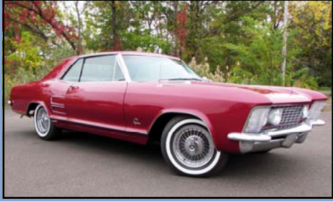
1964 Buick Riviera

This virtually flawless example features era correct dual 4-barrel carburetors. Beautiful in its Claret Mist exterior and Fawn Baronet interior. It features air conditioning, Autronic eye, cruise control, wire wheel covers and 4 new radial tires. Out of long term storage this classic Buick has been condition checked and thoroughly reconditioned. Believed to be 38,845 original miles. Still turning heads at 50!