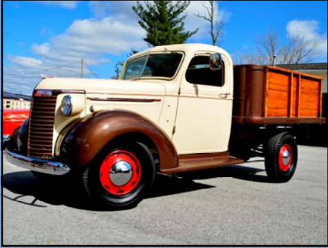
1940 Chevrolet Pickup

This truck is a very nice, rust-free, barn find, and has undergone a full nut & bolt restoration completed 5 years ago. It has the original 216ci engine and a 3-speed with a granny gear. Features the original 17" wheels and the original grain bed. Both the bed sides and rear are original, the bed floor has been replaced. It has been converted to a 12-volt system, the only modification from original. Excellent driving example.