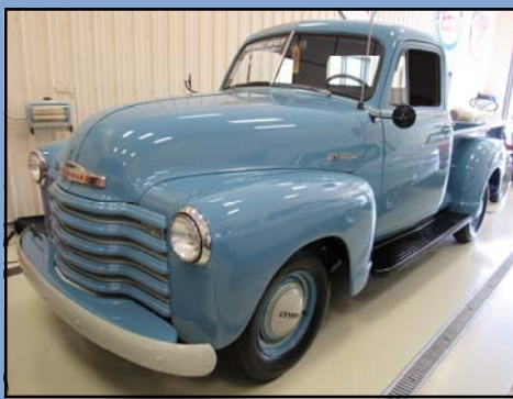
1952 Chevrolet 3100 Thriftmaster Pickup

A well maintained Carrera with only 39,000 miles. It has the 6-speed manual transmission. Red with black interior and black top and factory two-piece alloy wheels with painted crests. It features the heated sport seats with stamped crests. Comes with the factory books, tool kit and 2 sets of keys.