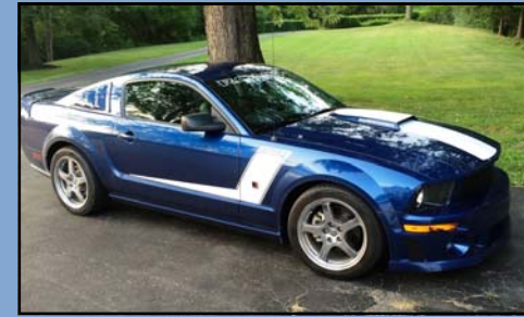
2009 Ford Mustang Roush 429R

This is an all original, air-conditioned car. It has just 21,000 original miles from new. This is one of, if not the nicest Coupe DeVille's to be found.