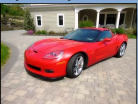
2008 Chevrolet Corvette Coupe

This Superbee is in the Superbee Registry. It has a recent 440ci V8 with an automatic transmission. It was restored approximately 5 years ago. It is finished in blue with a black vinyl top and the Superbee badging. A nice 1969 Dodge with a great engine.