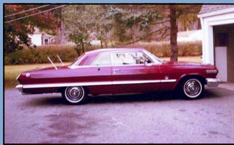
1963 Chevrolet Impala SS Hardtop

All original paint, interior and chrome. It has only 62,000 original miles and runs and drives like new.