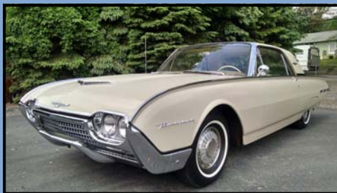
1962 Ford Thunderbird Coupe

A terrific Commander with a 283ci V8 and automatic transmission and just over 8,400 original miles. It is 99.9 % original and has been garage kept its entire life. It has the original window sticker, purchase order and owner's manual. Original miles. The seller's grandfather purchased the car new.