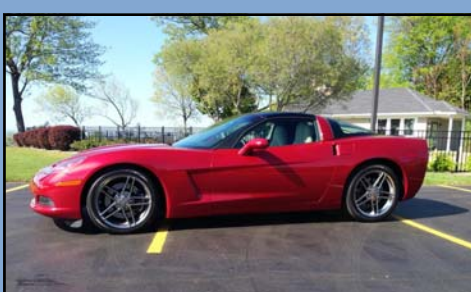
2005 Chevrolet Corvette Coupe

This VW Thing is a Florida car that runs and drives great. It has a new top. Powered by the 4-cylinder VW engine with a 4-speed manual transmission. Very rare and collectable.