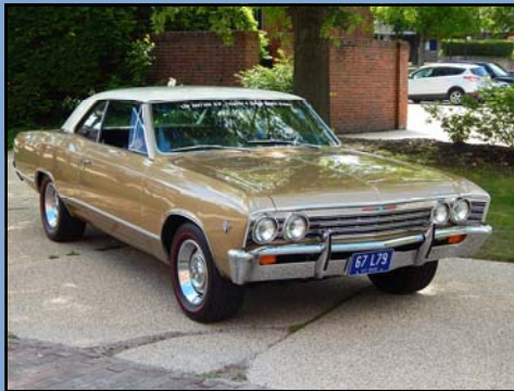
1967 Chevrolet Malibu

A correct L-79 engine equipped car with a 4-speed manual transmission. It was frame off restored, but still retains its factory sheet metal. It is an ISCA show winner in its correct Granada Gold and Cameo Beige.