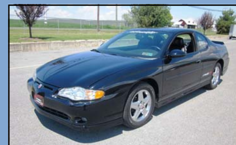
2004 Chevrolet Monte Carlo SS

Only 9,000 miles on this 3LT Z-51 Corvette. It features a glass top, heads up display, 6-speed manual transmission and over $10,000 in upgrades. It has 550hp and has never been raced and has never seen rain. This car was built and owned by a service manager from the largest Chevrolet dealership in the country.