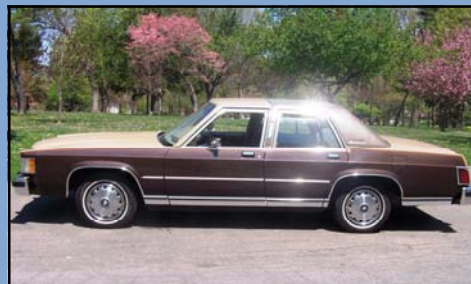
1985 Mercury Grand Marquis

Only 61,338 original miles on this Silverado. It has its original paint and the bed is in like new condition and was never used for hauling.