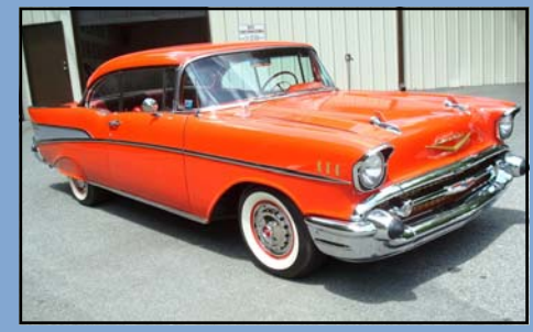
1957 Chevrolet Bel Air Hardtop

Just as the day it was new. This is 1 of 1,600 produced and it has only 8,025 original miles. It is a very rare 6-speed manual transmission and is a Pennsylvania 1 owner car. It has all the documentation. Am appreciating collectable