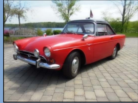
1965 Sunbeam Tiger

With only 43,000 original miles, this Boxster is as clean as they come. It has a clean Carfax and a current inspection. It has a 2.5 Liter 209hp 6-cylinder and a 5-speed manual. Options include a power roof, power windows, power door locks, power heated mirrors, climate control, AM/FM with CD, rear spoiler, anti-theft system, bra, car cover and leather interior. This car has been serviced by the Porsche dealer.