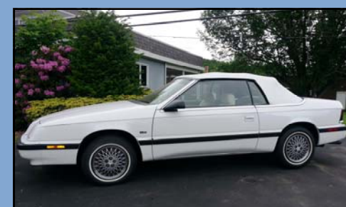
1990 Chrysler LeBaron Convertible

A rare and unique vehicle with Crimson Pearl paint and Shale leather interior. The engine is the 4.6 Liter 320hp Northstar V8 with a 5-speed automatic. It features a power folding hardtop, keyless entry, 18" polished alloys, magnetic ride control, heads-up display, heated/cooled 8-way power seats, dual climate control, HID headlamps, Bose 6-disc CD changer and DVD navigation.