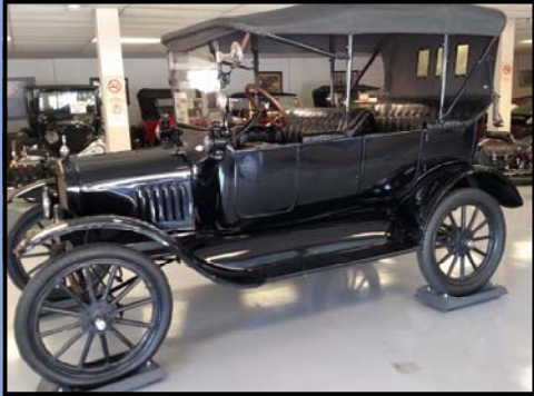
1917 Ford Model T Touring

Model T Fords of the “brass era” are probably the most desirable types to the average enthusiast. Certainly they are the most ornate and spectacular in appearance. This Model T Touring has a belt drive transmission with a 4-cylinder motor. A nice driving example.