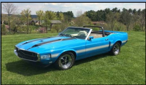
1970 Ford Shelby GT-350 Tribute

A complete frame-off restoration was completed 5 years ago. Everything has been either rebuilt or new parts added. The engine is the original 283ci Power Pack V8. The rear end is original with new parts added. The automatic transmission is a completely rebuilt unit. Under dash a/c was added for comfort. This North Carolina Bel Air had over $67,000 spent on the restoration alone and it has won every show it has been entered into.