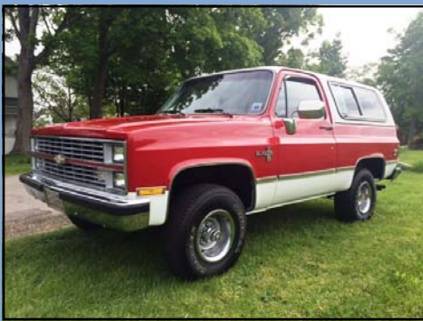
1984 Chevrolet K5 Blazer

Sold new by a local northeast Pennsylvania dealer who, upon taking it back in trade, decided to keep it for himself. It is a numbers matching original example. The engine and transmission were freshened up in 2005. It has had one re-spray. It runs and drives very well. It would make a great candidate for restoration in view of the current upward swing in Tiger values.