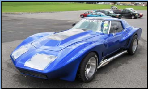
1968 Chevrolet Corvette Coupe

A highly modified Corvette with a custom Greenwood Can-Am style wide body. Over $10,000 invested in the built 427ci V8 alone, with unlimited power. This machine is ready for the track or can be made into a street car. Not for the faint of heart.