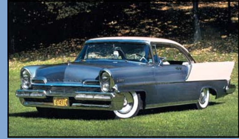
1957 Lincoln Premiere

Here is a rare opportunity to own a very nice Corvair Corsa Turbo. Colored in Evening Orchard, which was a one year only color and showing only 40,000 miles. It is equipped with a 4-speed manual transmission and the 180hp turbocharged engine. Runs and drives as good as it looks, so don't miss this excellent example.