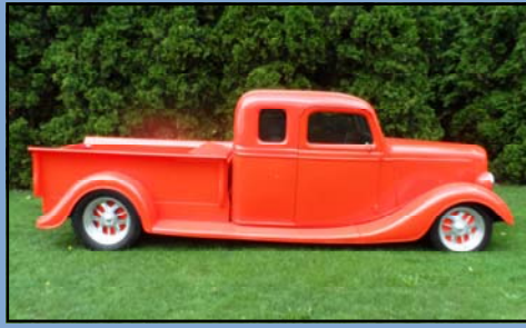
1936 Ford Truck

One of 1,500 1993 Mustangs produced in triple white with just 34,000 miles. Comes with its window sticker and protect-o-plate. Equipped with air conditioning, electric remote mirrors, power top, glass rear window, electric AM/FM stereo, power door locks, power steering and power windows. It has a 5.0 EFI V8 engine with the 5-speed transmission. Always garaged.