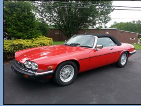
1989 Jaguar XJS Convertible

This Impala received a body-off, frame-up restoration that started in 1993 and finished in 1999. Every part was replaced or rebuilt including the original 283ci engine and the 2-speed Powerglide. It has been driven approximately 14,000 miles since. The color is the original Twilight Blue Poly. It recently had brand new tires installed.