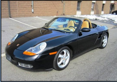
1997 Porsche Boxster

This truck is a very nice, rust-free, barn find, and has undergone a full nut & bolt restoration completed 5 years ago. It has the original 216ci engine and a 3-speed with a granny gear. Features the original 17" wheels and the original grain bed. Both the bed sides and rear are original, the bed floor has been replaced. It has been converted to a 12-volt system, the only modification from original. Excellent driving example.