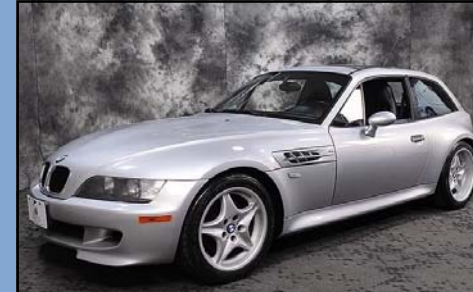
1999 BMW M Coupe

This rare "Air Cooled" Carrera 4 runs like a responsive tool, alive to the touch, bursting with character and fun. Yet no other Porsche riles the same mental, physical, and emotional responses as the 911 Carrera 4. This Grand Prix White w/ Dark Blue Top over Marine Blue Leather 1990 Only 82,161 CARFAX Certified miles.