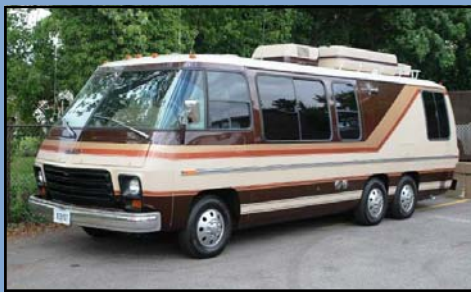
1978 GMC Motorhome

A correct L-79 engine equipped car with a 4-speed manual transmission. It was frame off restored, but still retains its factory sheet metal. It is an ISCA show winner in its correct Granada Gold and Cameo Beige.