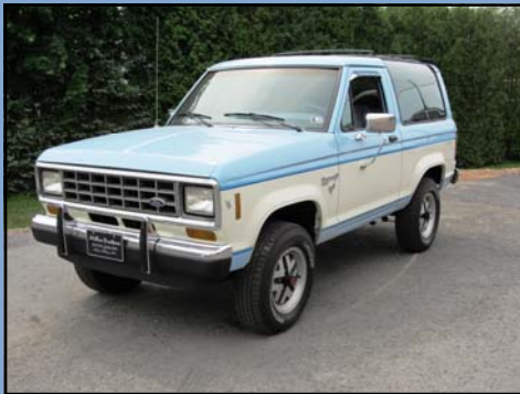
1986 Ford Bronco II

This is a very clean, matching numbers car with full chrome and a 350ci 270hp V8 engine. It has an automatic transmission, factory air conditioning, power steering, T-tops and removable rear window. It is an older restoration with only 24,700 miles. It has nice chrome and new tires making it a good driver and show car. This Corvette has been a part of Jerry's Classic Cars & Collectibles Museum for the past 18 years.