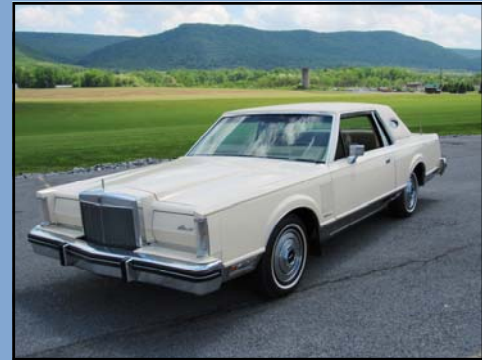
1982 Lincoln Mark VI Coupe

This beautiful Ford is powered by a small block Chevrolet with a Turbo Hydramatic 350 automatic transmission. It has air conditioning and power windows. This one of a kind truck was professionally built.