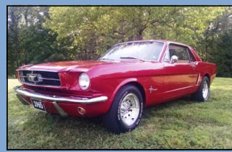
1965 Ford Mustang

You might search for years and never find a nicer 1952 Thriftmaster truck. Only 32,773 original miles and it received a no-expense spared concours quality nut and bolt frame off restoration. The color is a beautiful Twilight Blue. It has the rare farmer's 4-speed manual transmission, rare factory radio and rare factory heater. This truck is newer and nicer than it was in 1952.