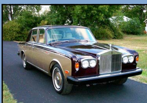
1974 Rolls Royce Silver Shadow

This car has not been restored, but only freshened up. You will never again find one in this condition. This is a true investment grade Mercury with all the original documentation. It has 34,000 original miles and is the last of the survivors. It has a new top and new carpet. These will only go up in value.