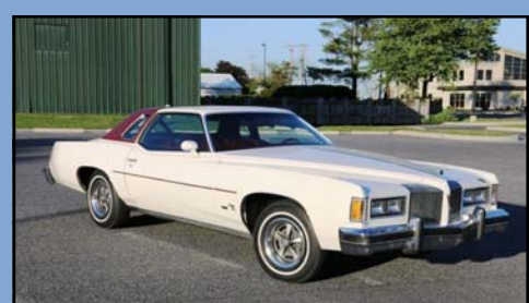
1976 Pontiac Grand Prix LJ

Over 2,500 hours in this incredible low mileage build done by a master fabricator, Mike Wilson of Wilson's Autobody in Altoona, PA. This GTO named "The Midnight Cherry" has a LS 6.0 Liter drivetrain, tubular suspension, custom 20" wheels, custom grill, lights and rear bumper, climate control, custom interior, custom dash and all new smoked glass. 1 of a kind!