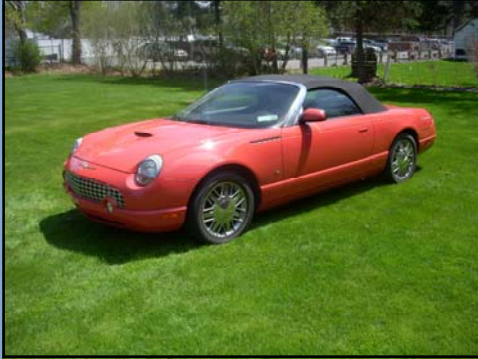
2003 Ford Thunderbird

Ford made 700 replicas of the car Halle Berry drove in the James Bond movie "Die Another Day". This is # 527 of 700 produced and it has only 21,400 original miles and was driven only 1,400 miles in the last 9 years. All paperwork from new as delivered and all service records. This Texas car has never had rust and is blemish free. Very collectable Thunderbird.