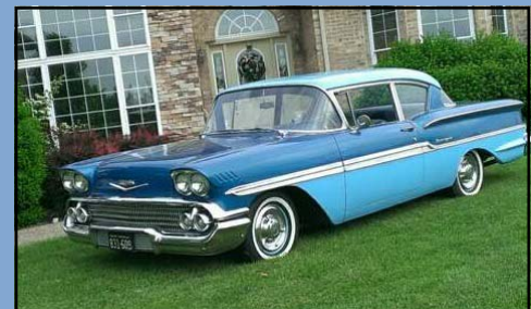
1958 Chevrolet Biscayne

This is a very nice Grand Marquis with only 1 previous owner. It was always garaged and its appearance is immaculate. The V8 engine has 65,419 miles and it has an automatic transmission. A locally owned vehicle that has a very reasonable reserve.