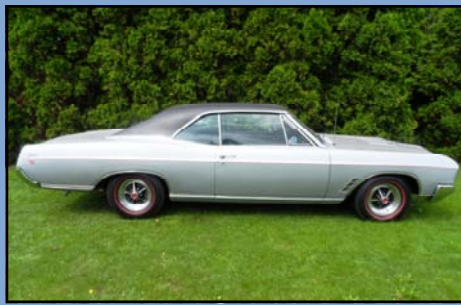
1966 Buick Grand Sport

This turn-key Pickup is a full custom with a hand built frame. The restoration was completed approximately 6 years ago. It is powered by a 1968 327ci 300hp V8 with a Turbo 350 transmission. Features a 4-link rear suspension, 3.55 ratio Ford 9" rear, TCI front suspension, Ron Francis wiring and a custom interior by Weavers of Williamsport, PA. It has 1,705 miles since built. A fantastic build that is ready to go.