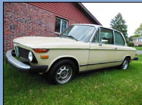
1975 BMW 2002

A rare find with only 28,889 original miles. It spent its life in North Carolina and has a rust free body. Has all power equipment and runs and drives like new.