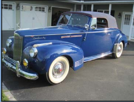
1941 Packard 120 Convertible Coupe

This virtually flawless example features era correct dual 4-barrel carburetors. Beautiful in its Claret Mist exterior and Fawn Baronet interior. It features air conditioning, Autronic eye, cruise control, wire wheel covers and 4 new radial tires. Out of long term storage this classic Buick has been condition checked and thoroughly reconditioned. Believed to be 38,845 original miles. Still turning heads at 50!