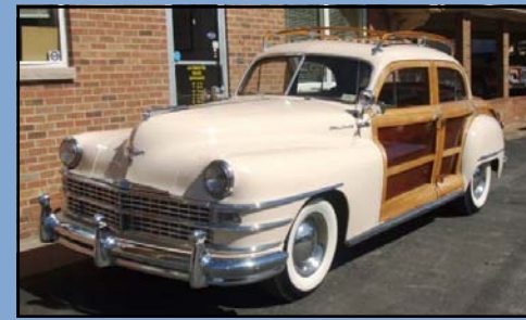
1947 Chrysler Town and Country Sedan

This older restoration shows 69,000 miles on the odometer. The engine is a numbers matching 340hp 409ci V8 with a Powerglide automatic transmission. Also, has power steering.