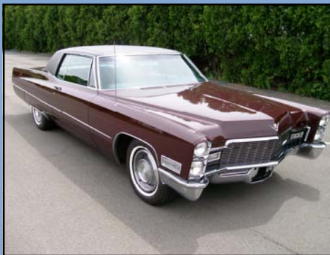
1968 Cadillac Coupe DeVille.

This V12 powered Coupe has an automatic transmission and is a matching numbers example. It is an original car that has never been restored except for 1 re-paint in 1983. Finished in a beautiful dark blue with blue leather interior and sporting wire wheels with whitewall tires. Has had the same owner for the past 35 years and has very low mileage.