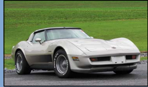
1982 Chevrolet Corvette Collector Edition

This Impala has had the same owner for the past 18 years. AACA Senior Award in 2013. It has a 396ci 325hp V8 with a Turbo 400 transmission. It has power steering, power brakes, power windows, tilt steering wheel and auto trunk release. The drivetrain was completely rebuilt. It was repainted in 2010 in a beautiful Regal Red., bumpers rechromed in 2011 and a new top in 2010. It has solid, original floors.