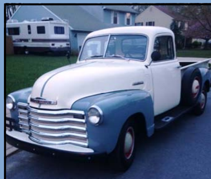
1950 Chevrolet 3600 5 Window Pickup

A 1959 Beetle Ragtop is a rare sight indeed. One of the nicest real California VW's you will find. It has a Performance 1,980cc engine with 138hp that makes this Beetle fly. It has pop out rear windows, disc brakes, stainless exhaust, EMPI wheels, Weber carburetor and a beautiful red interior. Only driven 850 miles since completion.