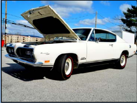
1969 Plymouth Barracuda

A 4 year complete nut and bolt rotisserie restoration with everything either new or rebuilt with NOS parts. It is a matching numbers car with a 383ci V8 and a 4-speed manual transmission. It has the A57 package and is one of only 378 Cuda's made with a 383 of which only 130 were 4-speeds.