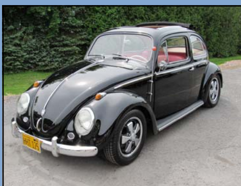
1959 Volkswagen Beetle

This Yenko Tribute is powered by a big block with a 4-speed manual transmission. It was rotisserie restored and looks beautiful.