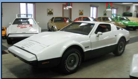
1975 Bricklin SV1

A rare Nova Wagon with a newly rebuilt 355ci Stroker and Turbo 350 automatic. The rear end is a rebuilt 3.36 with all new parts. 3 inch exhaust system with Flowmaster's installed. Has an AM/FM CD Player, new 17" wheels with Redline tires, electric rear window, power steering and disc brakes. A North Carolina car with only 150 miles added since it was built.