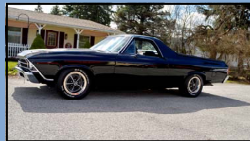
1969 Chevrolet El Camino

A 1-owner Thunderbird that is very clean. It comes with its original bill of sale and window sticker and a copy of the original title. Runs and drives great.