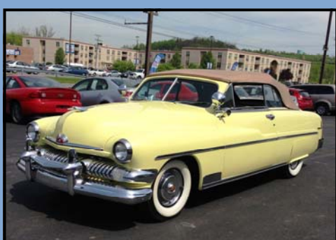
1951 Mercury Convertible

A highly optioned true SS396 with factory air conditioning. It has been professionally rebuilt with some modern upgrades. This car looks great from its amazing black paint to its engine bay and drives better than new.