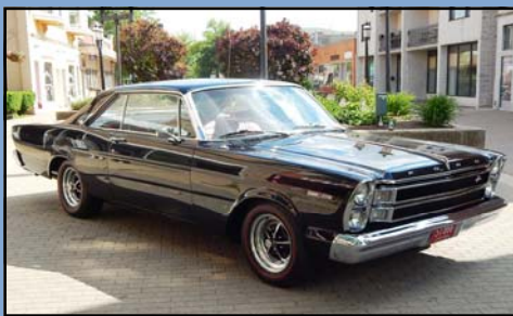
1966 Ford Galaxie 500 XL

This terrific LeMans has its PHS documentation and is fabulously painted in its correct Teal turquoise. The interior was changed to Parchment. It has power steering, power brakes and a power top. It has a V8 with a 4-speed manual transmission. Rarely seen in this nice of condition.