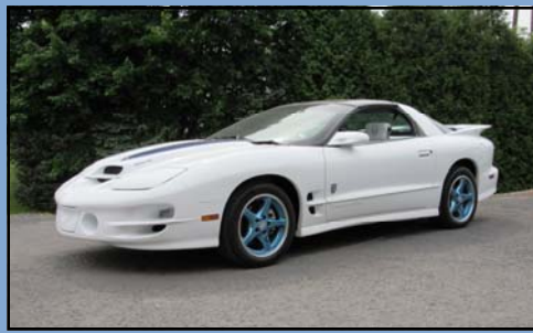
1999 Pontiac Firebird Trans Am WS6

This 2-owner 4 x 4 Blazer is out of North Carolina and has the Silverado package. It received 1 repaint and is 100% rust free inside and out. It has the V8 power with an automatic transmission. Has new tires and the original spare. A very rare find and has factory air conditioning.