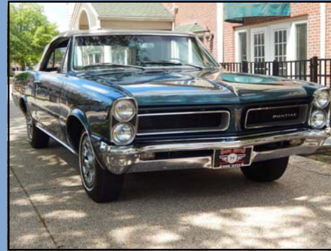
1965 Pontiac LeMans Convertible

This is a pampered, 1 owner GMC with only 33,000 miles on it. It was used to travel to Nas-car and Indy events. It was always stored in a climate controlled storage facility. It has been completely serviced and is ready to go.