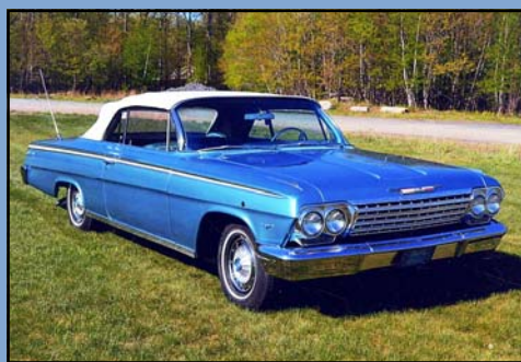
1962 Chevrolet Impala Convertible

This beautiful and classic 1958 Thunderbird was the first year for the "Square Birds". It has a freshly built 352ci V8 engine with a 3-speed Cruise-O-Matic automatic gear box. It has power steering, power windows and a new black and white interior. A great running car.